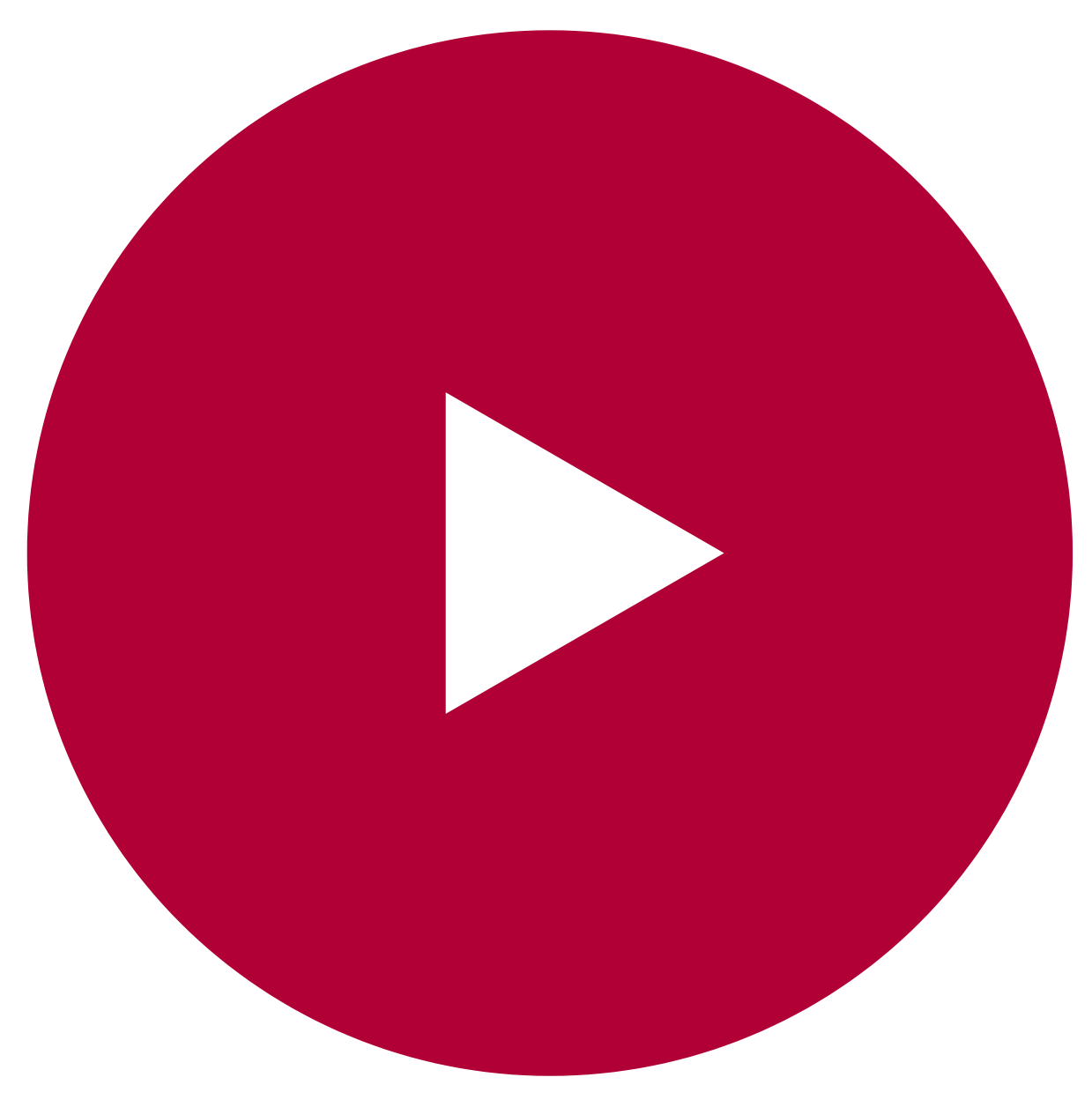
Choosing and using AI and technology in a law firm