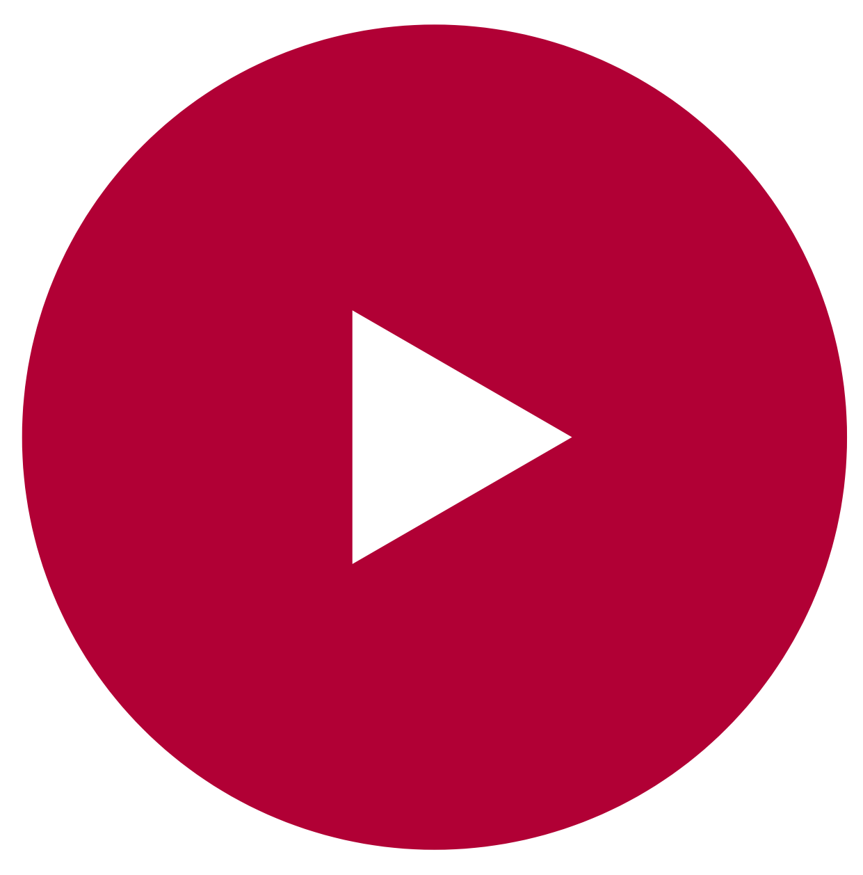
Al and tech: The evolving legal and regulatory environment