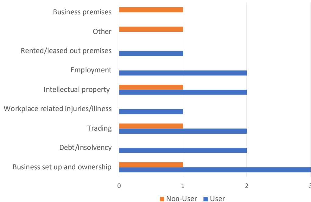
Figure 2. Legal experiences of small business informants (N = 13)

In sum, the individual consumer and small business informants interviewed exhibited a broad range of legal issues, not all of which were met. Note also that, given the targeted nature of purposive sampling, this sample is not intended to be statistically representative of individual residents of, or small businesses operating in, England and Wales.